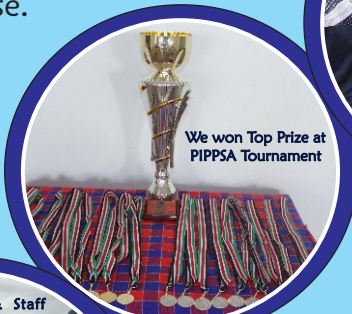
We won Top Prize at PIPPSA Tournament