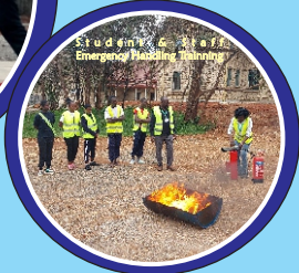
Student & Staff Emergency Fire Safety Training

During the visit, they were given a tour of the center's facilities.