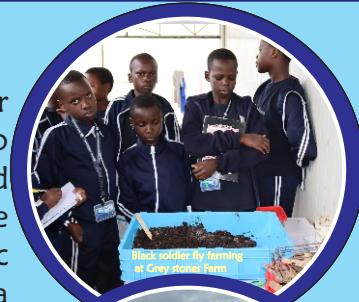
Black soldier fly farming at Grey stones Farm

At William holden, the students were excited to learn about the center's conservation efforts and see some of the country's native wildlife up close.