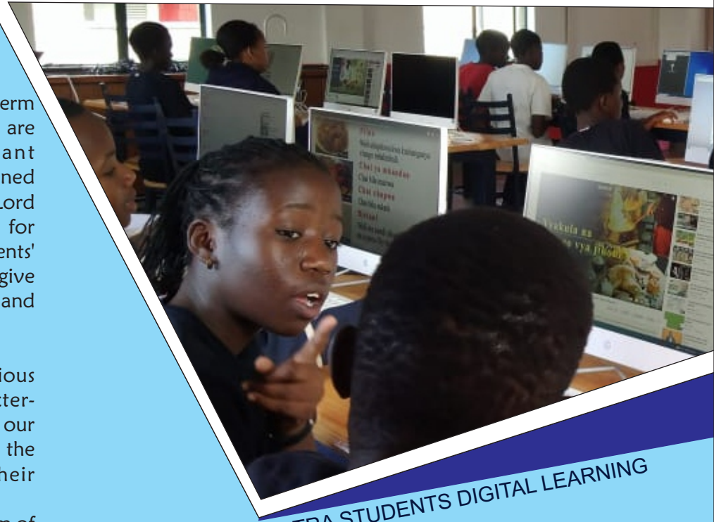
TRA STUDENTS DIGITAL LEARNING

As we prepare for the new term, we kindly request that all parents ensure that their children have the necessary equipment for their academic success. Students who have not yet acquired scientific calculators and geometrical sets are advised to do so before the start of the term.