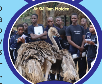
At William Holden