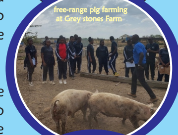
free-range pig farming at Grey stones Farm