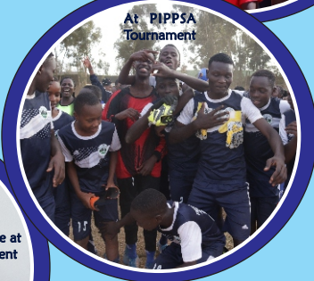
At PIPPSA Tournament