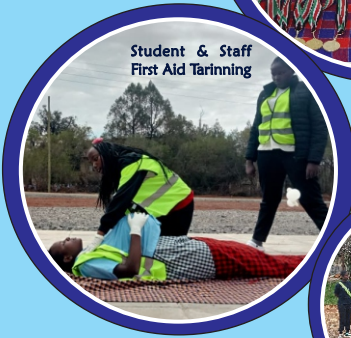
Student & Staff First Aid Training